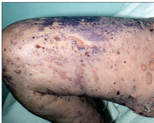
Figure 1 Blisters on the skin in pemphigus vulgaris.

Patients with pemphigus foliaceus rarely have